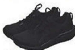
Plain Black Shoes (not sold at the uniform shop but can be purchased locally)