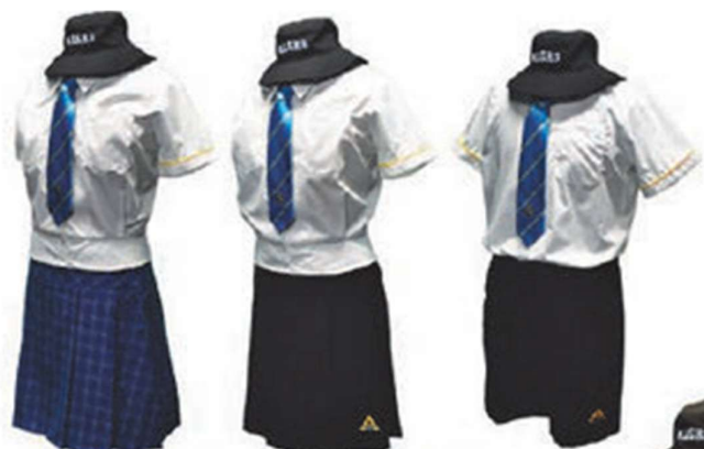
Formal Uniform Options (Years 10-12)