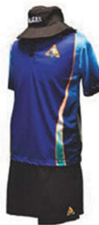
Everyday Junior Shirt (Years 7-9)