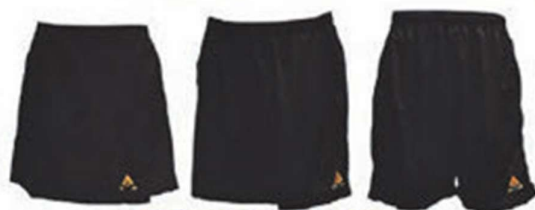
Short and Skort Options