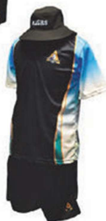
Everyday Senior Shirt (Years 10-12)